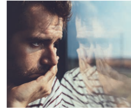
Usually for one person the loss cycle begins, there are 5 stages;

Coming to terms with losing someone who you thought you would be with forever, is one of the most difficult journeys a parent can take.